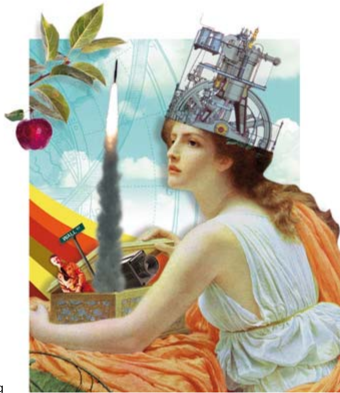
Illustration by Matt Herring

Yet even if government has scaled back its ambitions from the heights of the post-war welfare state, even if it is often inefficient and self-serving, it also embodies moral progress. That is the significance of the assertion, in the American Declaration of Independence, that "all men are created equal, that they are endowed by their Creator with certain unalienable rights". It is the significance of laws guaranteeing free speech, universal suffrage, and equality before the law. And it is the significance of courts that can hold states to account when they, inevitably, fail to match the standards that they have set for themselves.